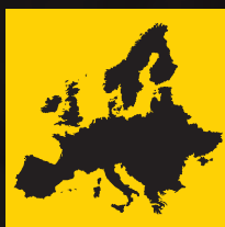
European Breakdown Cover